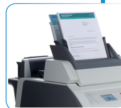
2 Sheet feeders and 1 insert/BRE feeder