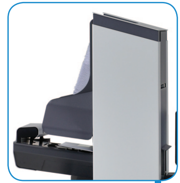
High-Capacity Vertical Output Stacker

** Bottom-address documents can be processed only in Half and Z-fold modes, up to 5 sheets.