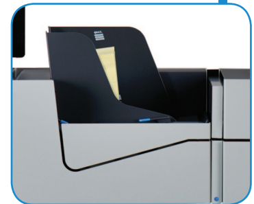
Thin Booklet Feeder