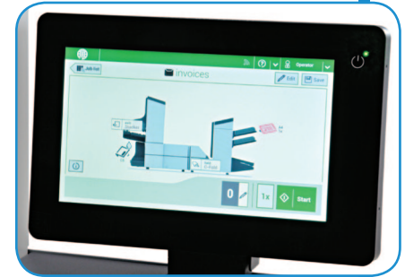
Color Touchscreen Control with Paper Presence Sensors & Graphical On-Screen Display