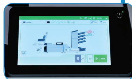
Color Touchscreen Control Panel with graphical interface