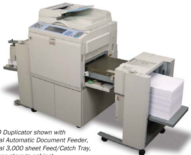
SD700 Duplicator shown with optional Automatic Document Feeder, optional 3,000 sheet Feed/Catch Tray, and base storage cabinet.