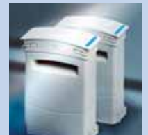
HP Bulk Ink Delivery